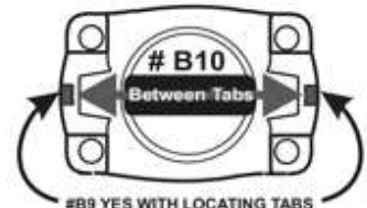
Typical FORD, DANA, some GM and some DODGE with TAB style yokes